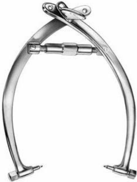
Skull traction tong