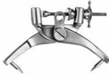
Crutchfield Skull traction tong